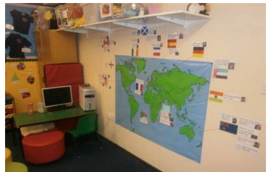
Map and ICT area