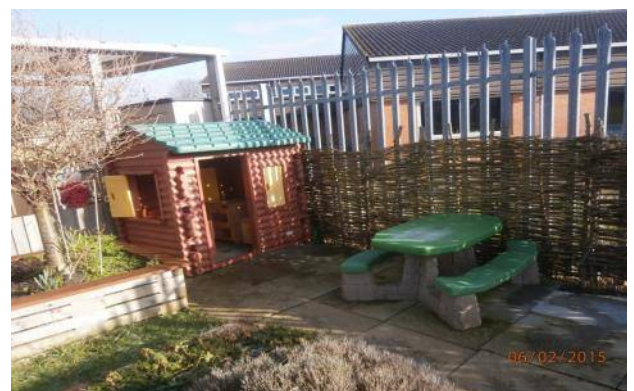
Outdoor imaginative area