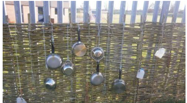
Musical fence used for outdoor group time