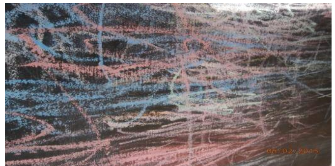
Large chalk board to develop gross motor skills